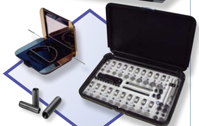
SPIROL® Series 550 Coiled Pins